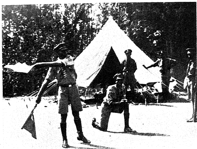
PATHFINDERS (NATIVE BOY SCOUTS) IN CAMP (Chapter VII.)